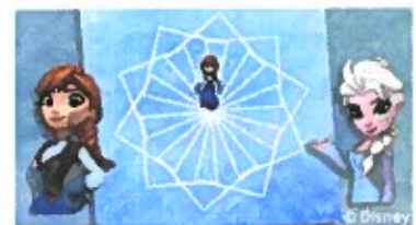
Code with Anna and Elsa