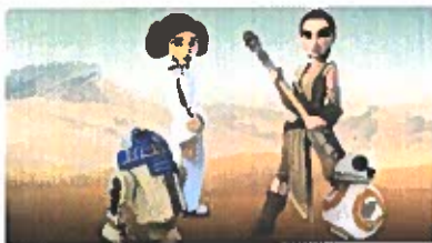
Star Wars: Building a Galaxy with Code